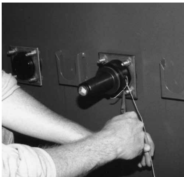
Figure 4. Attach ground lead (15 kV version shown).