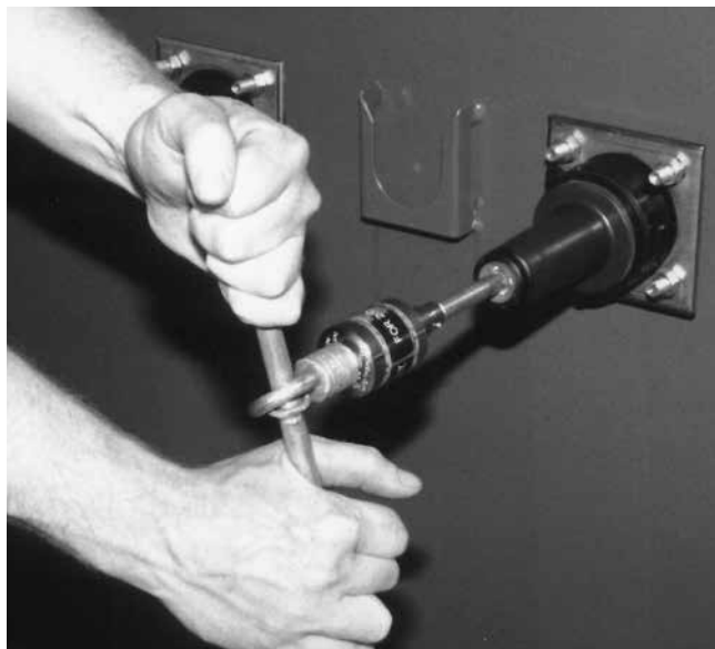
Figure 3. Insert torque tool and tighten to bushing well (15 kV version shown).

Once the mating component has been properly installed on the bushing, the yellow ring should be completely covered. If any yellow is visible, the elbow or protective cap must be completely installed or “latched” before energizing to assure a quality connection.