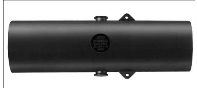
Figure 1. 600 A bushing extender unit (35 kV shown).

Visible break and adequate grounding must be provided before cable work proceeds. All associated apparatus must be de-energized during installation and maintenance. Failure to comply may result in death, severe personal injury and equipment damage.