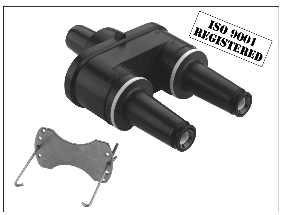
Figure 1. The Rotatable Feedthru Inserts with patented torque-limiting ratchet allows insert to be positioned to any orientation.

Instruction sheet S500-13-1 details the safe installation procedures that should be followed and are included with each insert. No special tools are required for the proper installation of the insert. A cleaned and lubricated insert is simply placed in a bushing well and turned in a clockwise direction. When the torque-limiting ratchet releases, giving an audible clicking, the insert will be properly installed and tightened to the correct torque. Continued rotation in a