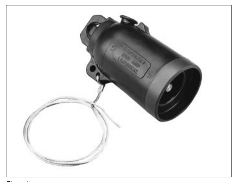
Figure 1. Insulated Protective Cap electrically insulates and mechanically seals loadbreak bushing interfaces.

Voltage ratings and characteristics are in accordance with ANSI/IEEE Standard 386-1995.